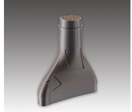
Figure 1: FDM sacrificial tooling begins with a 3D printed tool, which features a standard fill pattern designed to promote fluid flow during the tool removal process and provide adequate strength during elevated temperature, high pressure cure cycles.

Fine details. Smooth surface finishes. Accuracy. Strength. The best way to see the advantages of a Fortus 3D Printer is to have your own part built on a Fortus system. Get your free part at: stratasys.com .