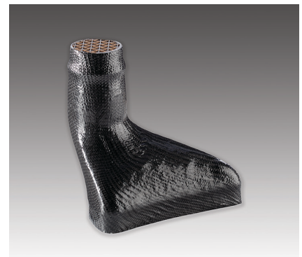
Figure 2: The composite material is then wrapped around the sacrificial tool as shown. Once the part is fully formed and cured, the tool is ready for wash-out.